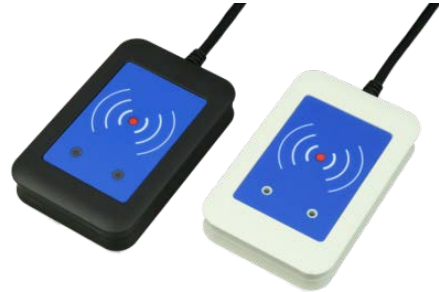
Desktop version (inlay customizable)

The TWN4 MultiTech 2 LF reader/writer allows users to read and write to almost any 125 kHz and 134.2 kHz tags and/or labels. It supports all major transponder technologies like HID, HITAG, Nexwatch, KERI, Cotag, CASI-RUSCO etc.